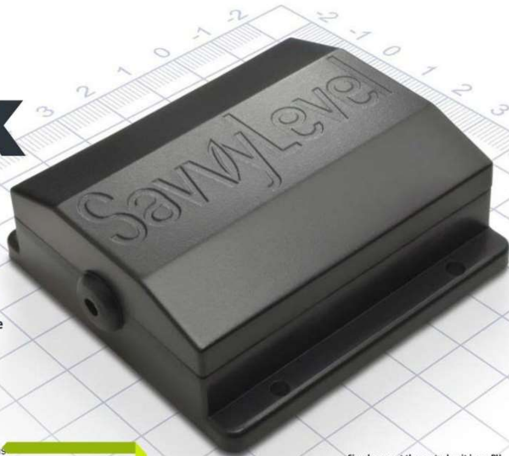
Simply mount the control unit in an RV cupboard for permanent installation

We've found that caravan and camping shows are a fantastic place for finding new products and gadgets. One of these recently impressed us because it levels an RV using an app – it's a little black box called the SavvyLevel.